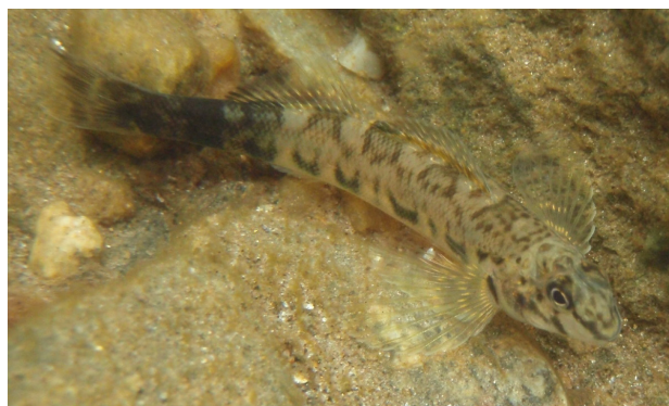
All the Greensides below the broken dam at Cane River oddly had dark caudal peduncles yet appeared quite healthy. Casper Cox

After an awkward sleep on hard ground and a quick morning breakfast, we drove west into Yancey County, and then bore northwest following the wide North Toe River upstream just beyond Loafers Glory. We then cut sharply west following the road that overlooked the Cane River. Parking at a wide spot I took a quick look but the visibility in the river was not to my liking. So while the guys descended with seines and the ladies with hammocks, I drove determined upstream past a river-rocked general store, on past many patches of newly tilled fields, and well beyond to the US 19E near Burnsville. Turning up alongside the Cane River, I found the ruins of a great dam. Returning with great enthusiasm to the lounging readers and turbid-water snorkelers, I assured them a promise that clear water was before us. After a stop at the rocky store for some NC Cheerwine, the regional beverage of choice, and lunch provisions, we were soon snorkeling among the mound builders, the pearlescent shiners, and