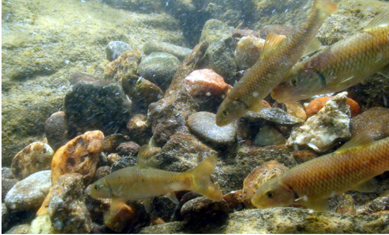
Fish Flurry (River Chubs - Cane River)