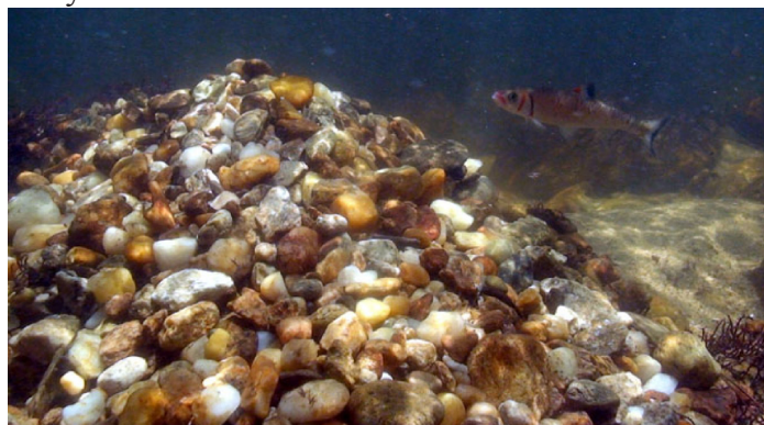
A fine mound built by a mighty Bluehead Chub and patrolled by an intruder, the ever expanding population of Warpaint Shiners, not native to Wilson Creek.

Arriving at the creek as the others were gearing up, Cobalt and I decided to drive upstream in search of my remembered site. A deep canyon, boulder pools, trout fisherman, and a fish camp community were not what I had remembered but it was intriguing for a future visit. We returned back to the group and then drove east to Johns River and followed it upstream. The water was churning muddy from the night's rain and the seemingly altered landscape increasingly frustrated me. Cobalt pointed out a house of mugs, a small house covered with mugs of all markings and we turned into the driveway for a closer view. Even the fence and mailbox were covered with mugs! Interesting, but by now I was fully bewildered and with the river muddy and opaque we decided to return to the group at Wilson Creek. It is pleasing to see what a protected watershed can provide for a clear stream like Wilson Creek while it is agonizing to witness the muddy Johns River with its adjacent disturbed ground exposed to heavy rains.