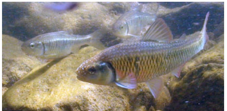
Striped Shiner - Cane River