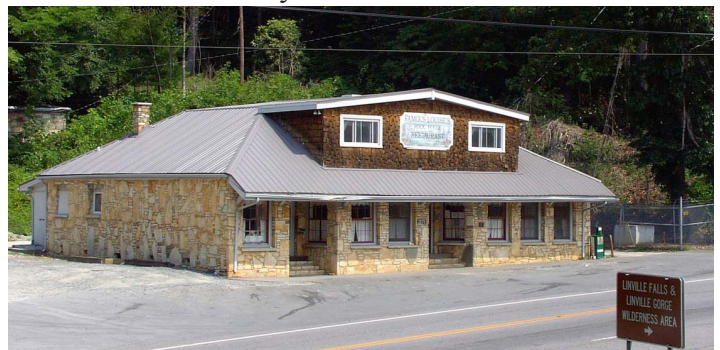
Famous Louise's Rock House Restaurant in Linville Falls