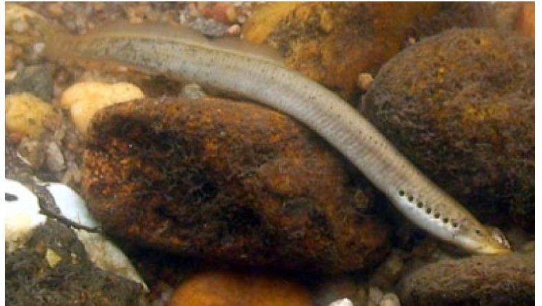
Mountain Brook Lamprey - Mills River